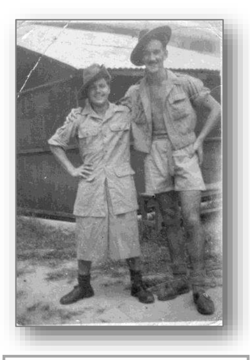
A moment of light relief: 'wee Jock' and I swap uniforms.

In April 1946 the hospital returned to its pre-war status and the RAF Mobile Field Hospital was gradually run down. However my dispatch rider duties continued into 1947.