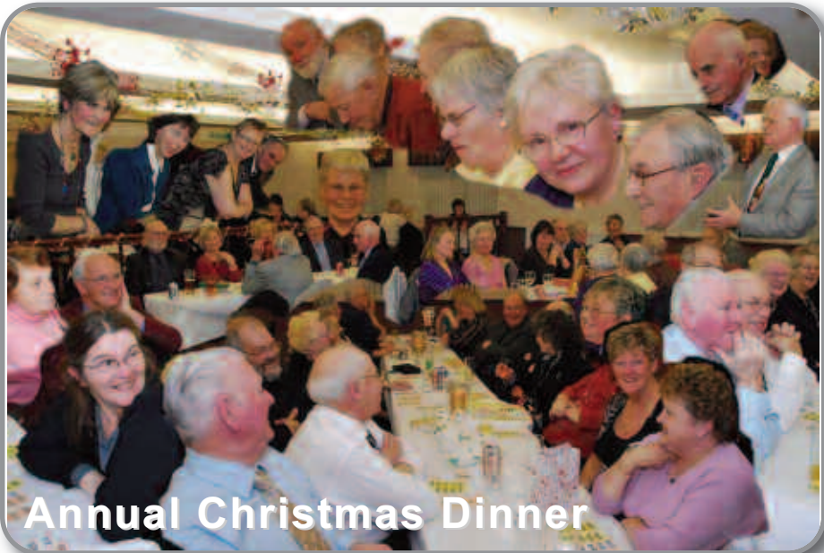
Above: The Society's 3rd annual Christmas dinner was held on Friday 21st December at Hollandbush Golf Club. 46 members and their guests enjoyed an excellent meal and social evening during which a raffle raised £148 for Society funds.