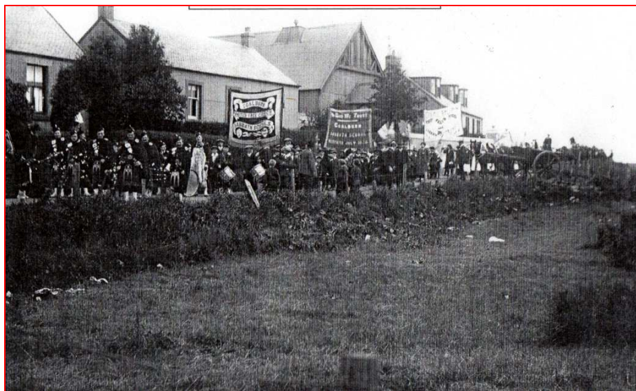
Sunday School Outing.